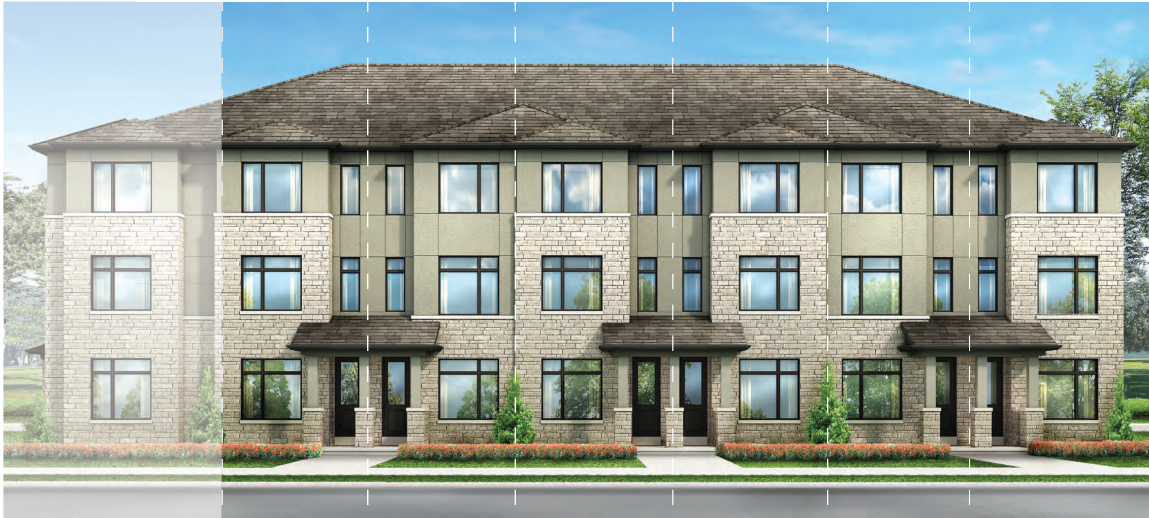
COOPER 15-3 • EL. 'A' CORNER