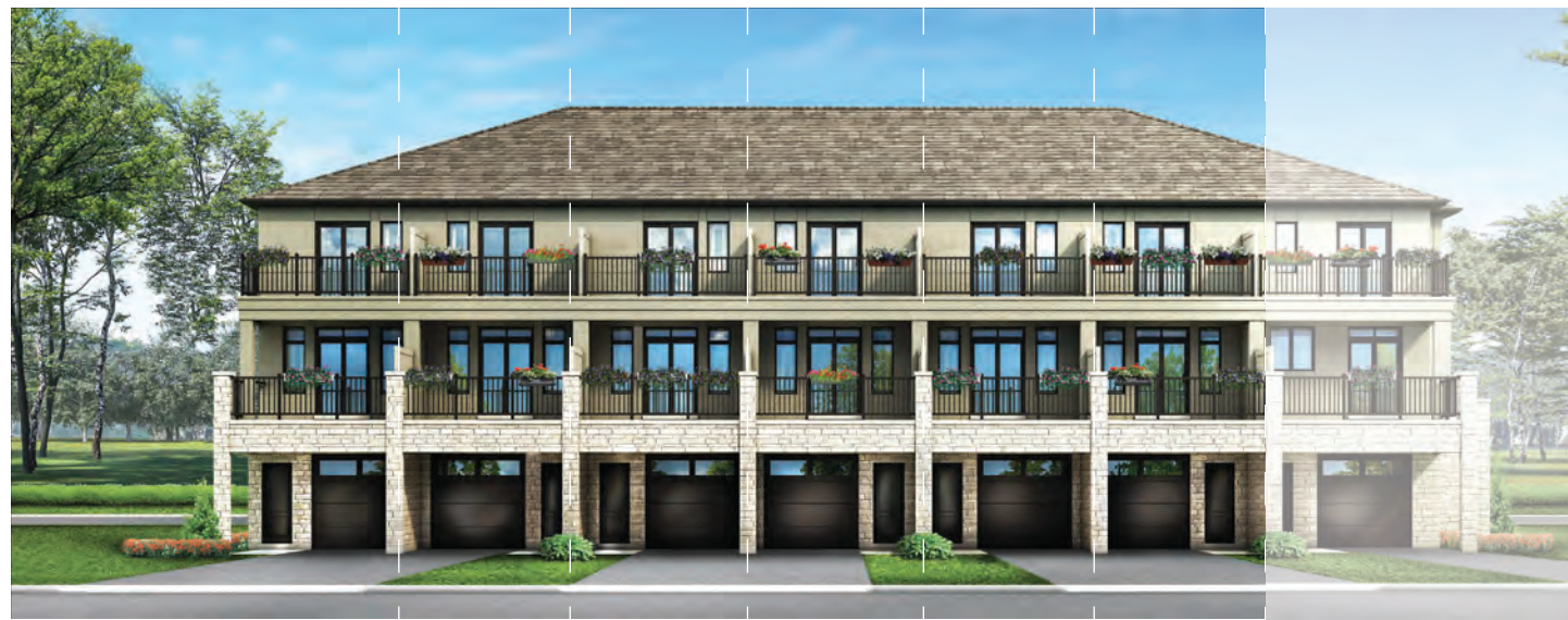
BENSON 15-2 • EL. 'A2' END CONDITION