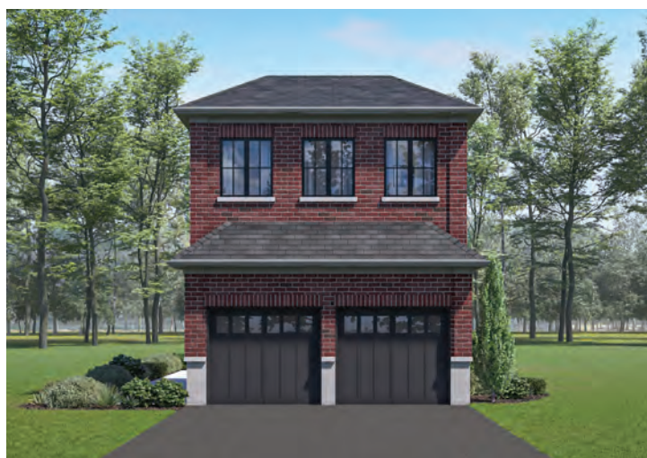
Elevation A | Rear