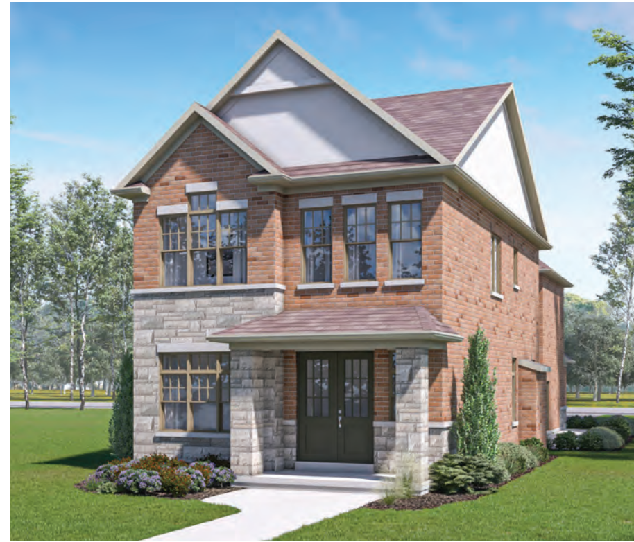
Elevation B | 2,605.ft.