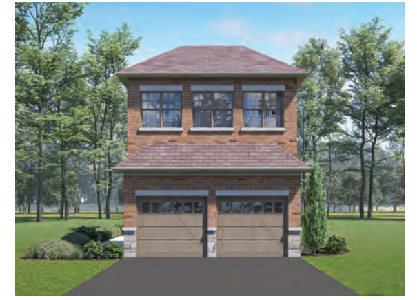
Elevation B | Rear