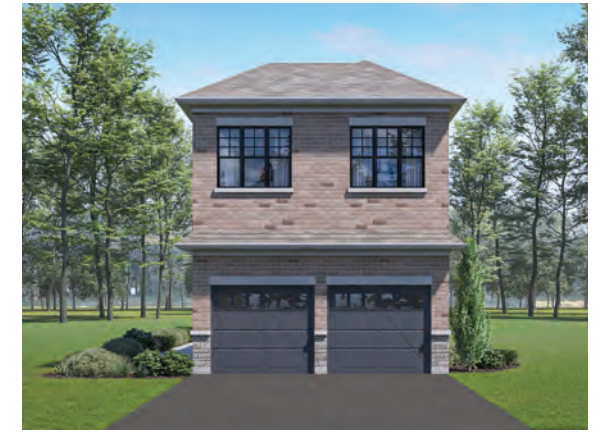
Elevation B | Rear