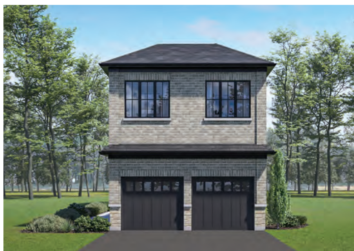
Elevation A | Rear