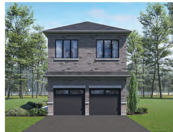
Elevation C | Rear