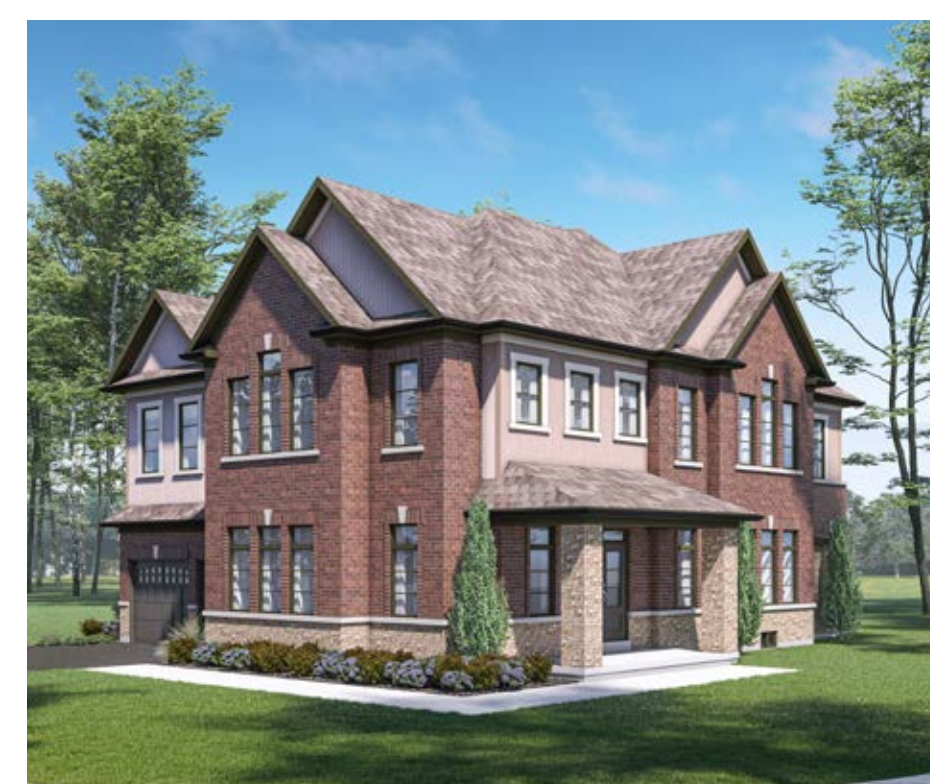
Elevation B | 3,818 sq.ft.