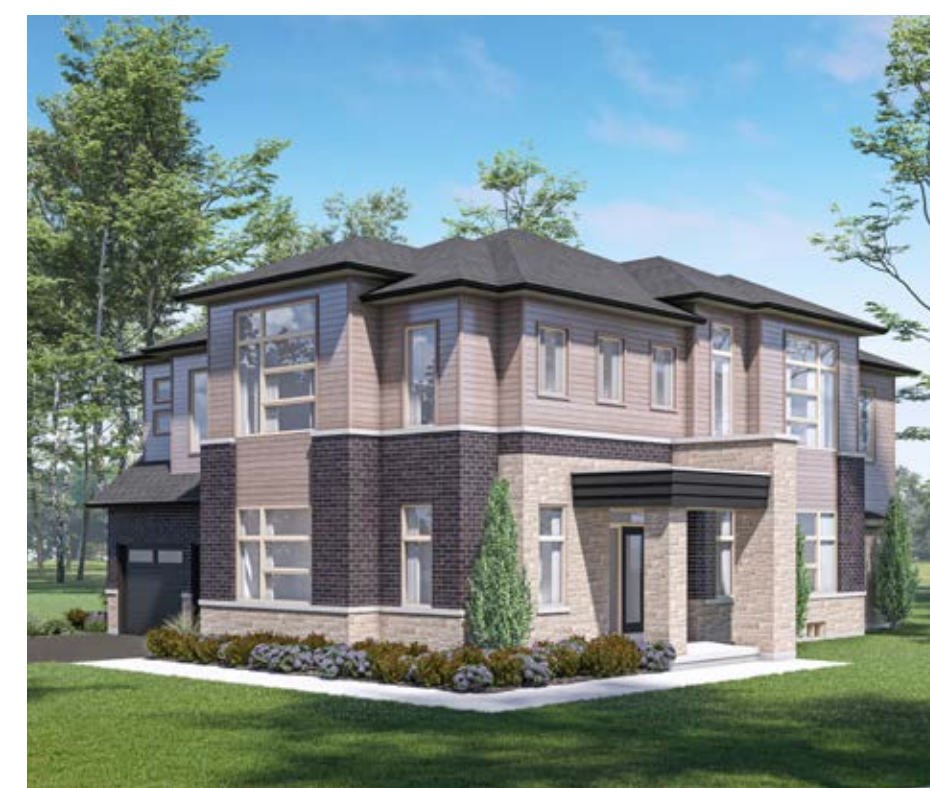
Elevation C | 3,784 sq.ft.