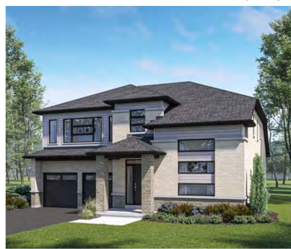
Elevation C | 2,999 sq.ft.