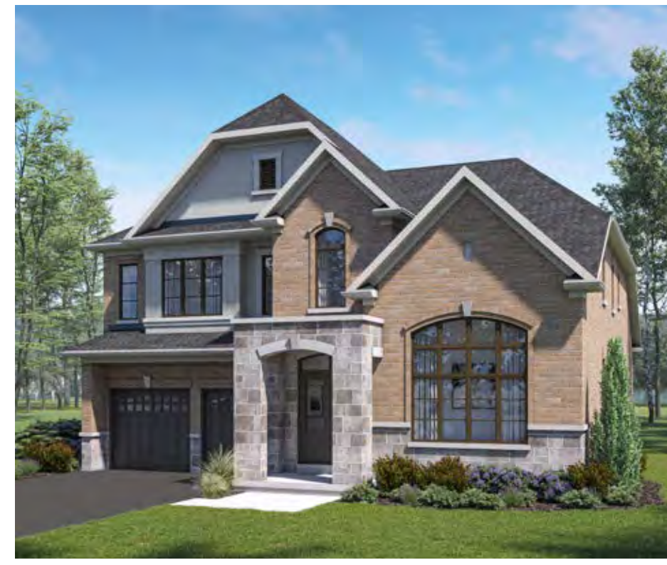
Elevation B | 3,015 sq.ft.