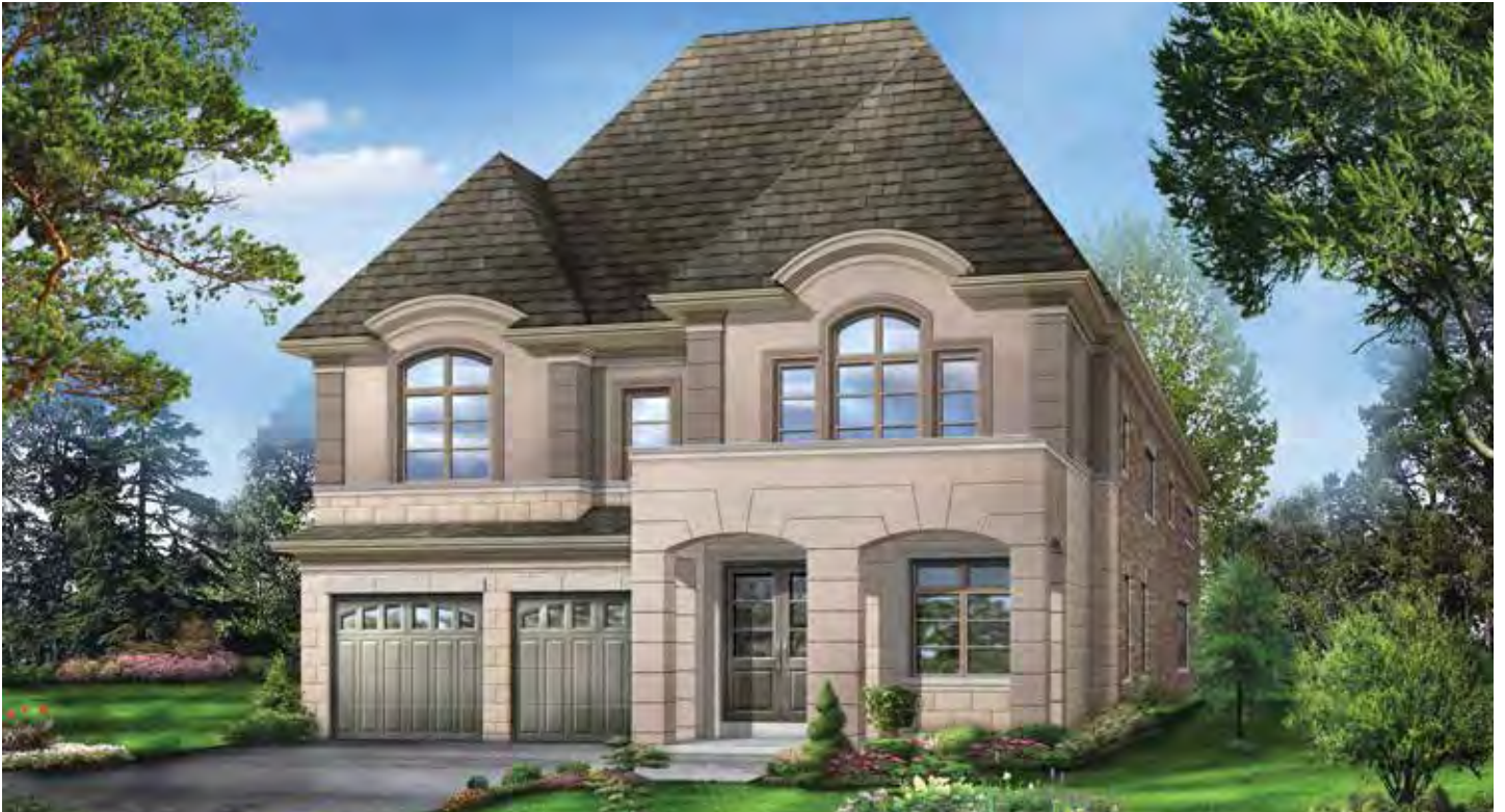
Elevation B • 3,366 sq.ft.