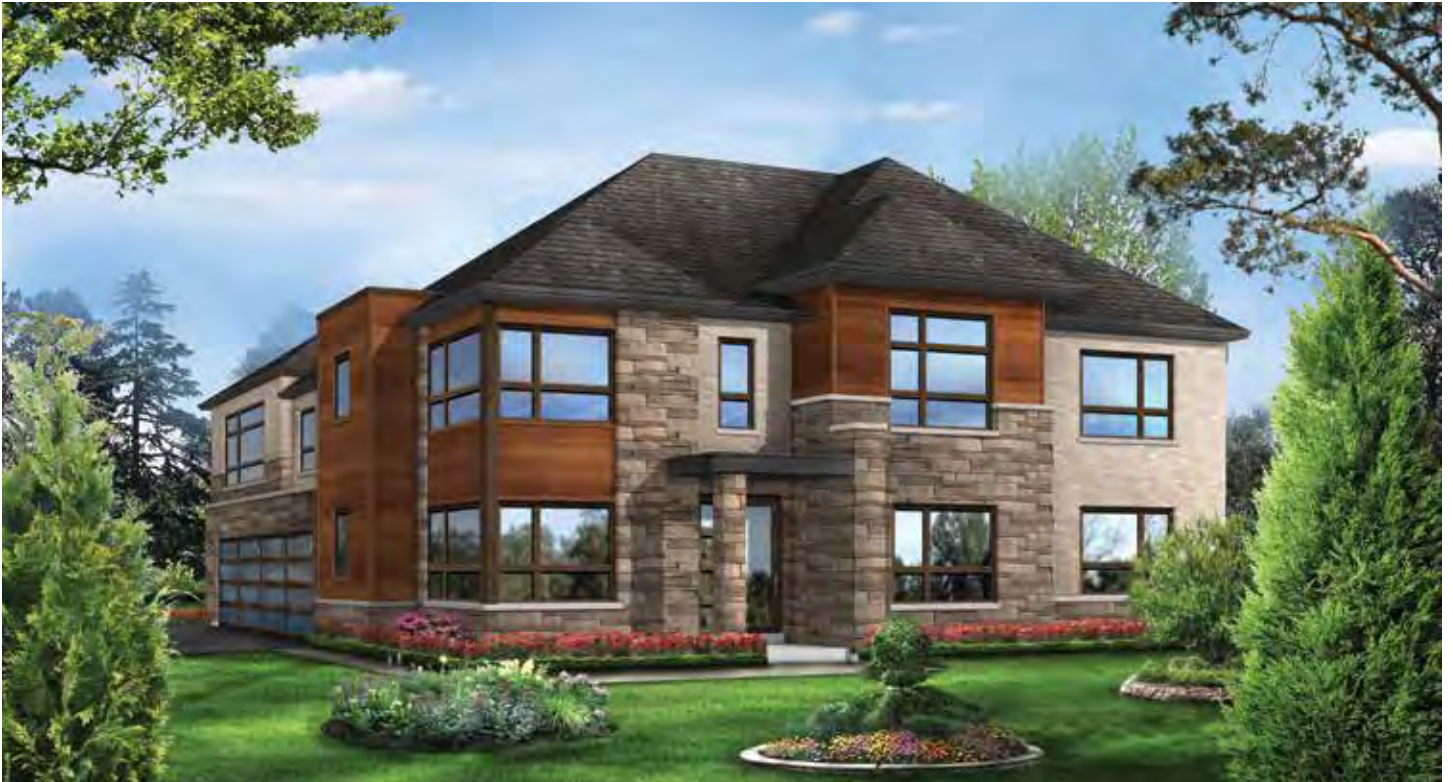
Elevation C • 3,558 sq.ft.