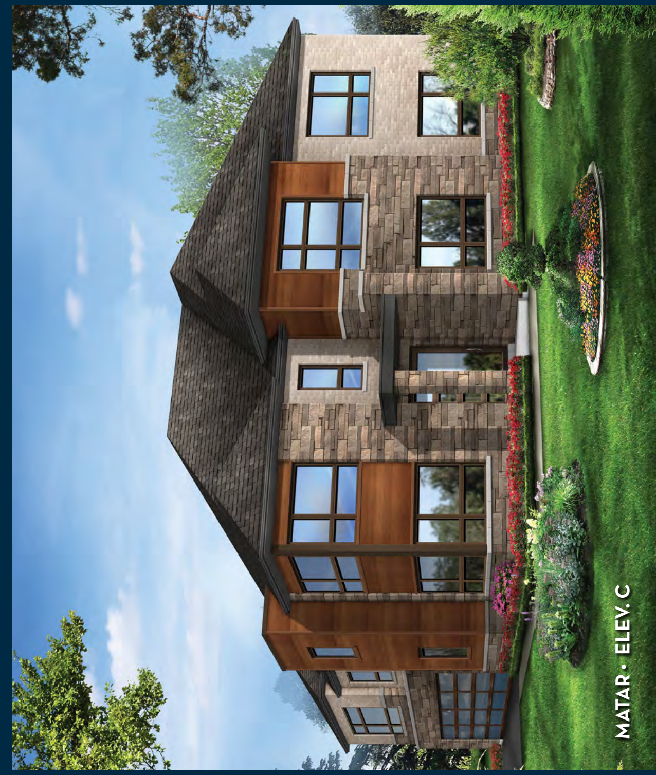
MATAR • ELEV. C