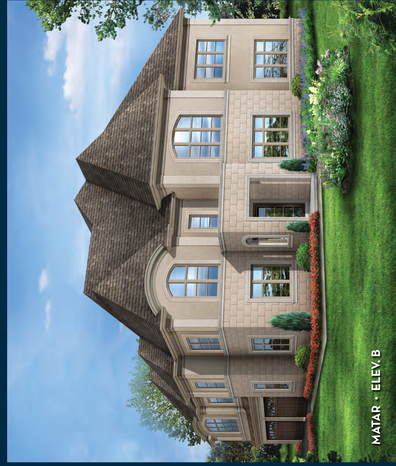
MATAR • ELEV. B

Dimension of home may be reversed and purchaser agrees to accept the same. Steps and porches may vary at any exterior entrance ways due to grading variance. Actual usable floor space may vary from the stated floor area. All renderings are artist's concept. All exterior ratings are black in colour where applicable. Dimensions, specifications and architectural detailing subject to minor modifications. E. & G.E. Copyright October 2017.