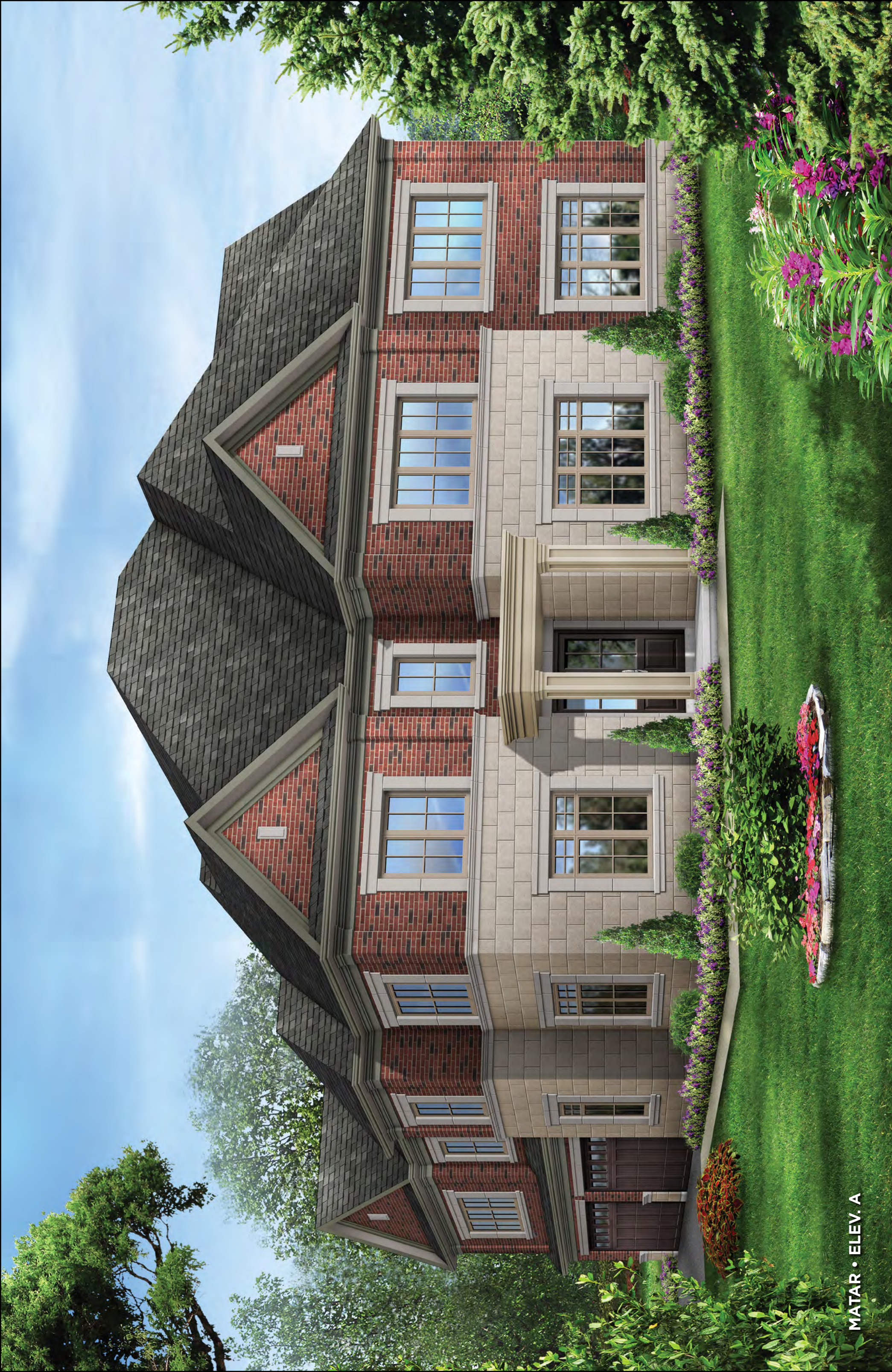
MATAR • ELEV. A