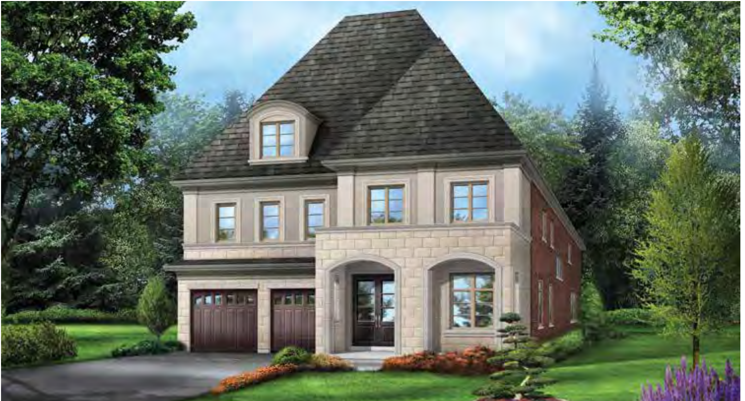
Elevation B • 3,701 sq.ft.