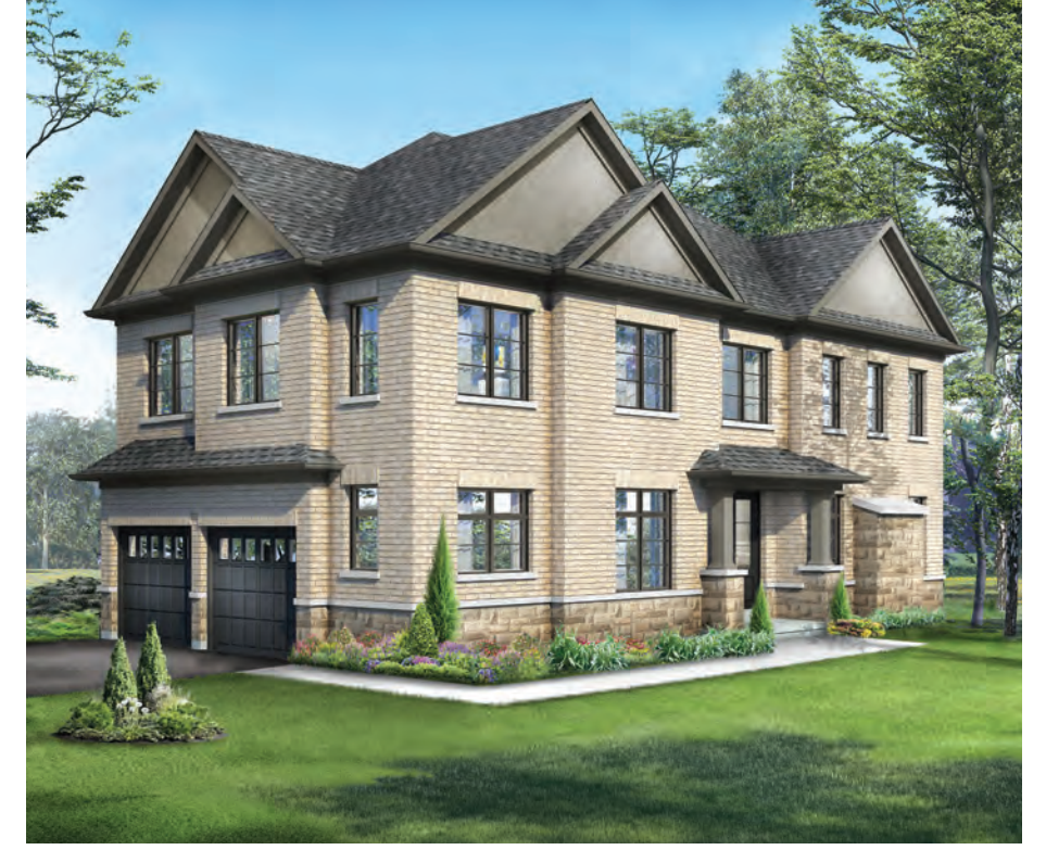
Elevation B | 2,169 sq.ft.