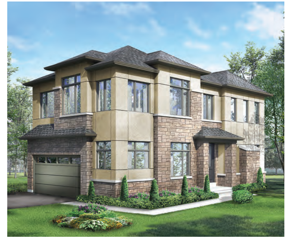
Elevation C | 2,156 sq.ft.