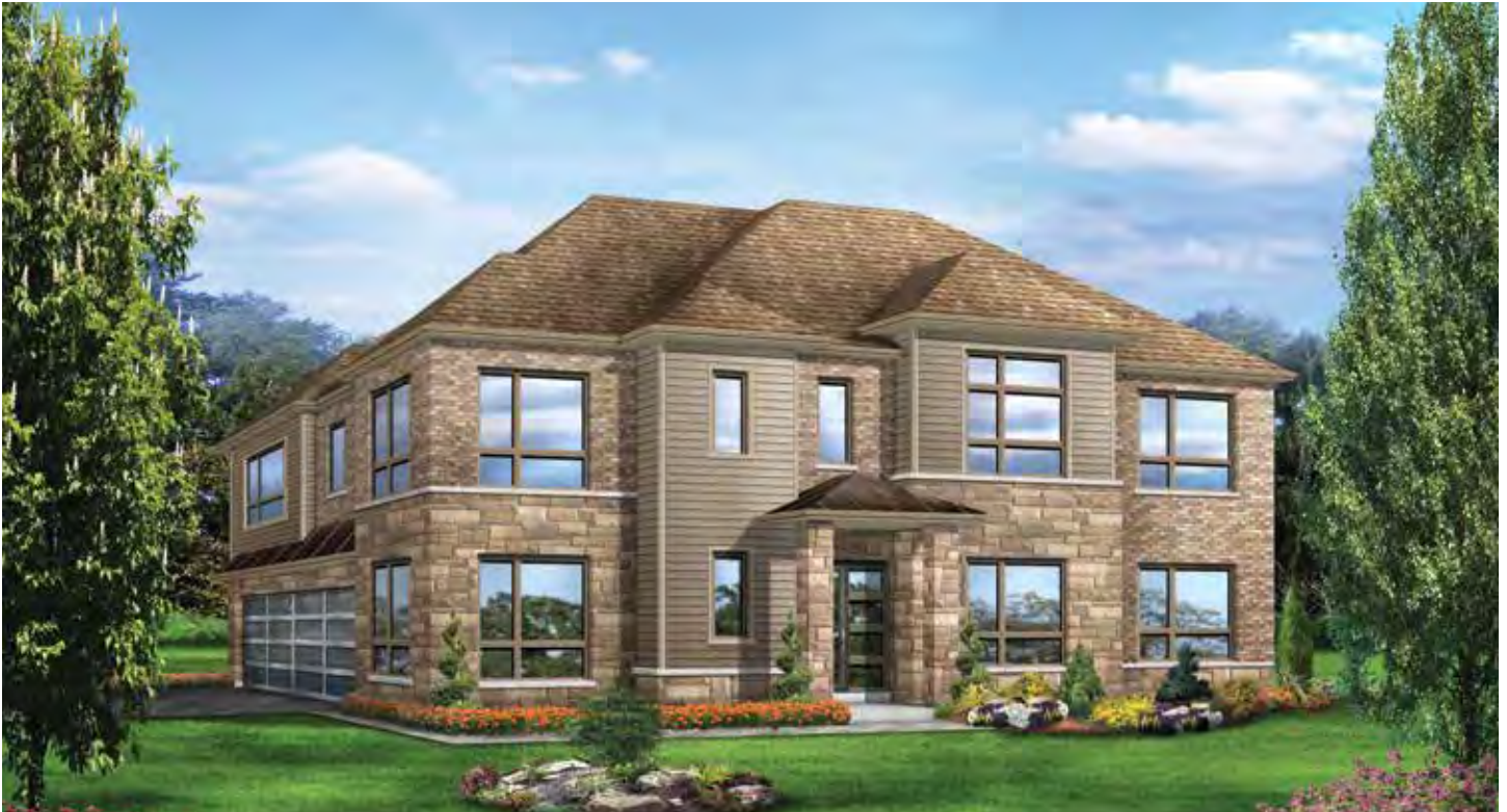
Elevation C • 2,981 sq.ft.